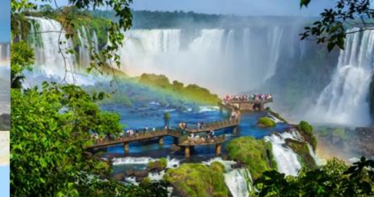
Waterfalls of Iguaçu

Sirius , the new Brazilian Synchrotron Light Source, will be the largest and most complex scientific infrastructure ever built in the country and one of the first fourth-generation synchrotron light sources of the world. It was planned to put Brazil on the leading position in the production of synchrotron light and is designed to be one of the brightest of all the equipment in its energy class ( https://www.lnls.cnpem.br/sirius-en/ ).